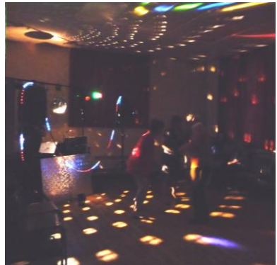
Fish and Chip Disco – Over 80 members of Clifton Village take part in an evening of fun at the Village Hall – come and join us at this fun event in 2011!